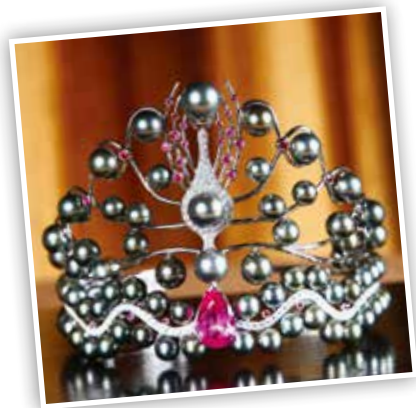
Tahitian pearl tiara created by Robert Wan Tahiti for the Ms. World China pageant

Going forward, supply, in general, will remain a challenge due to the shortage in the availability of baby oysters. "The government of French Polynesia is studying the feasibility of implementing a regulation concerning the volume of pearls that could be exported by pearl farms. The goal is to push for